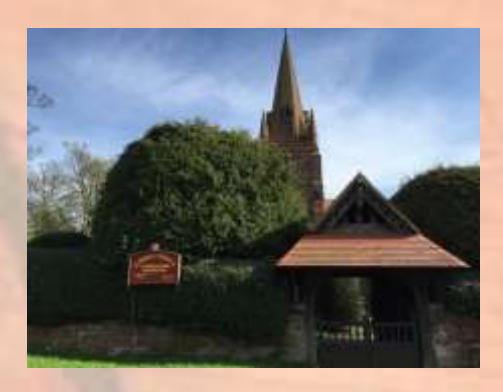
Parish Church News

pupils and their parents will be held in school on Monday 5<sup>th</sup> March at 3:30pm.